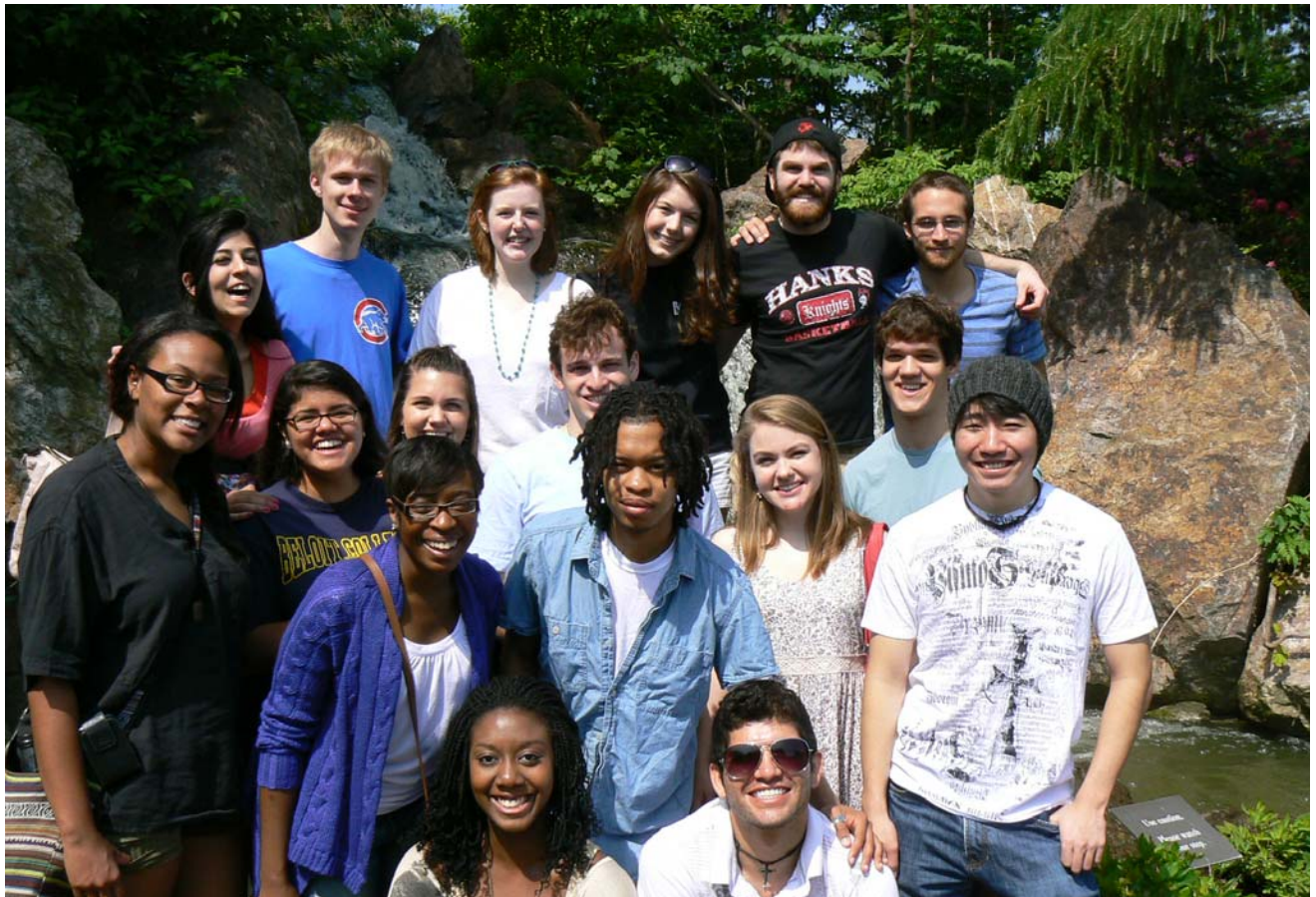
Members of the Kemper Scholars Class of 2013 on a group outing to the Chicago Botanic Garden, June 17, 2011